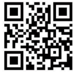
QR Code description

Preachers' Aid Society and Benefit Fund P.O. Box 19207 Springfield, IL 62794-9207 618-806-6819 edweston69@gmail.com pasbf.org